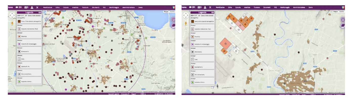
Figure 1: Stressor and residential areas in the Montichiari District and neighbors, focus on the quarrying activities.

To model the impact, 296 emission sources have been considered, for the air domain only, with 267 related to PM10 emissions (characterized also with respect to authorization data), accordingly to the recent prescription by WHO about their carcinogenic effects.